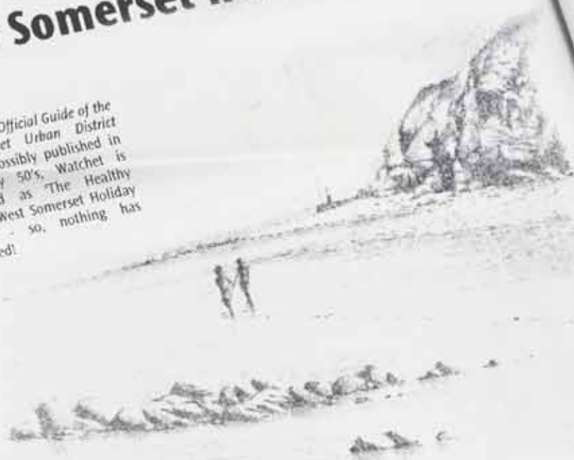
Long Beach Sands, Watchet

In The Official Guide of the Watchet Urban District Council possibly published in the early 50's, Watchet is described as 'The Healthy Happy West Somerset Holiday haunt' - so, nothing has changed!